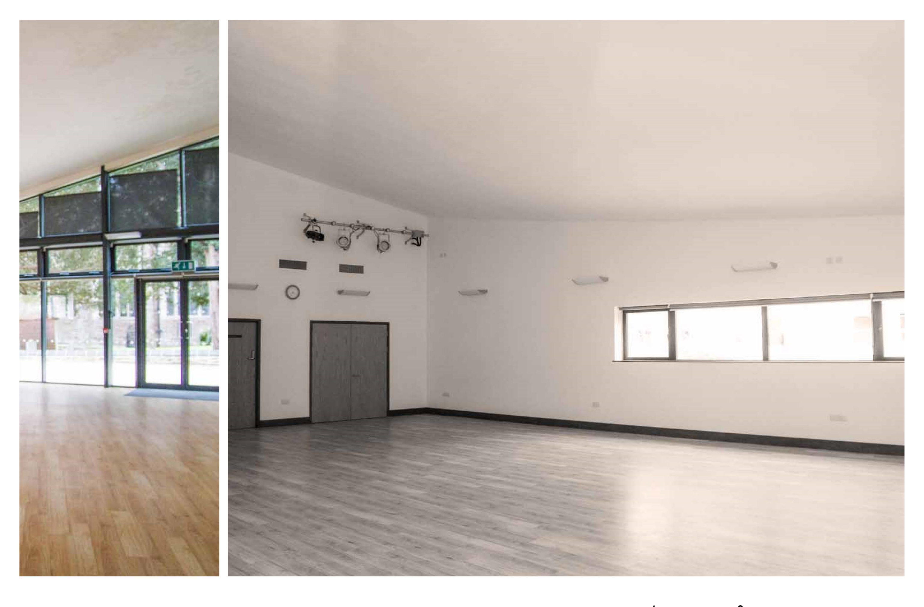
... to large conferences or events