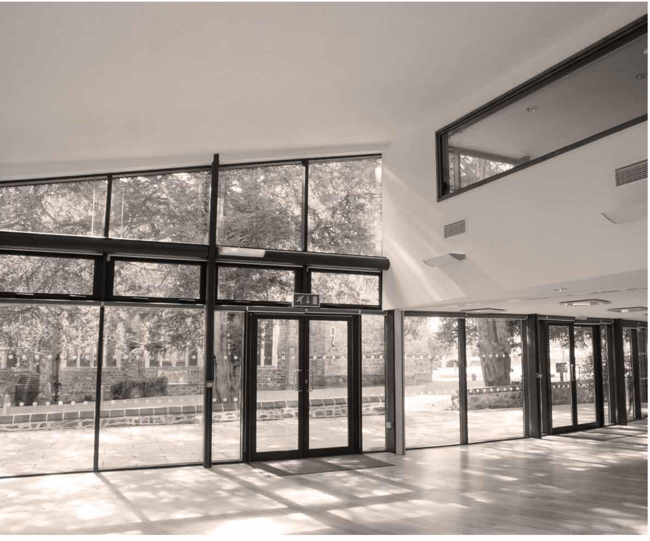
...with a range of rooms