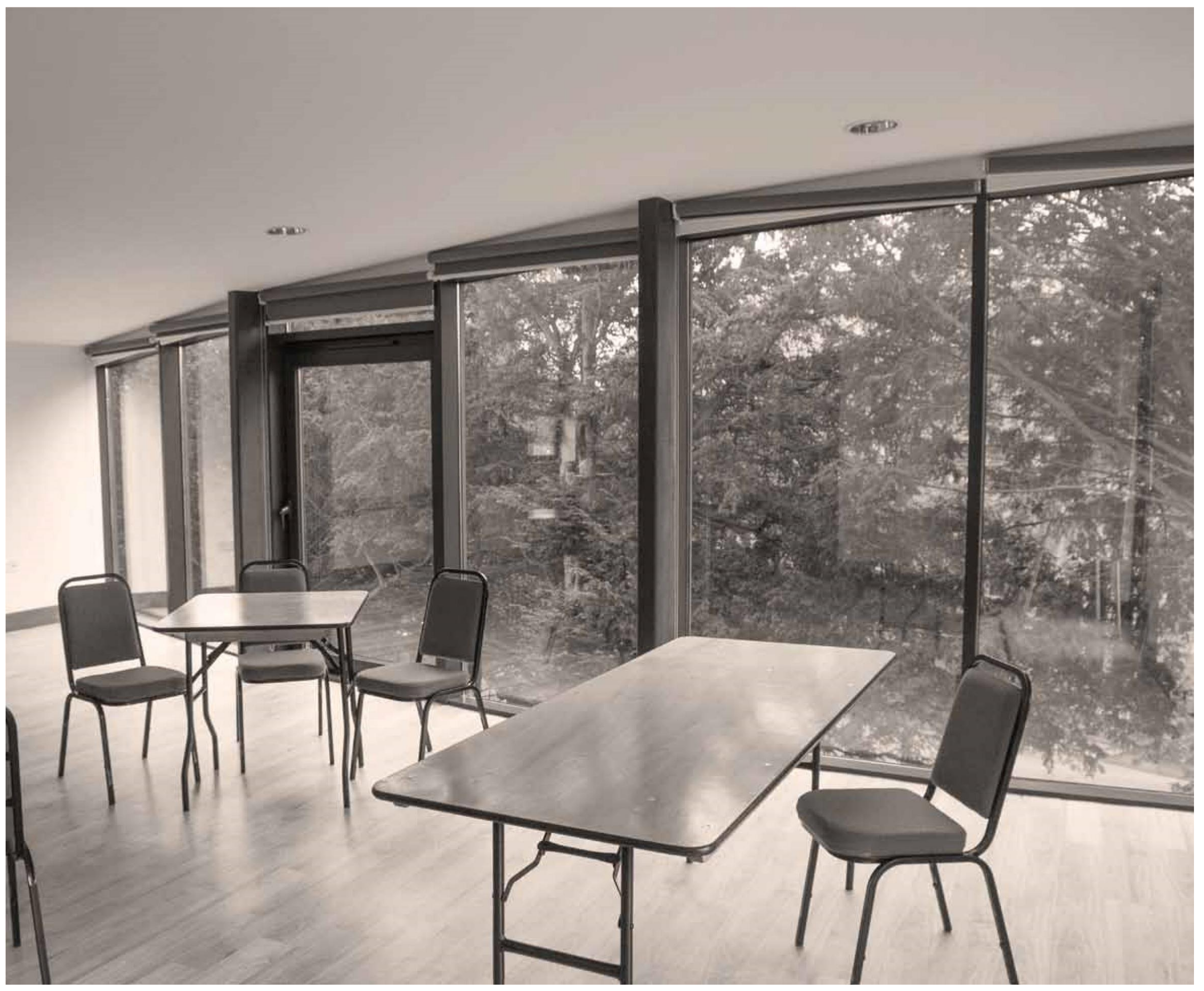
for smaller meetings & training...