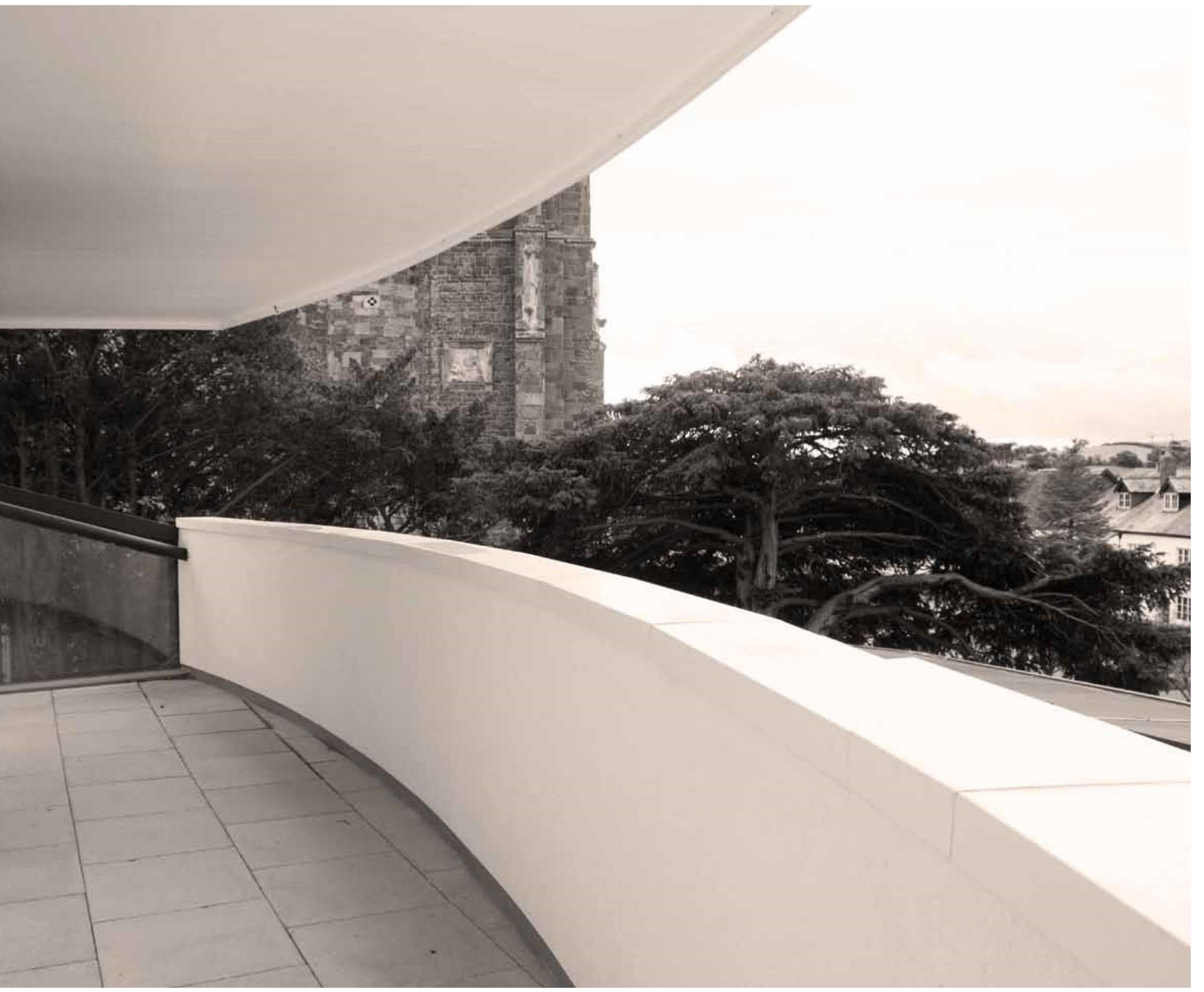
Light, airy spaces...