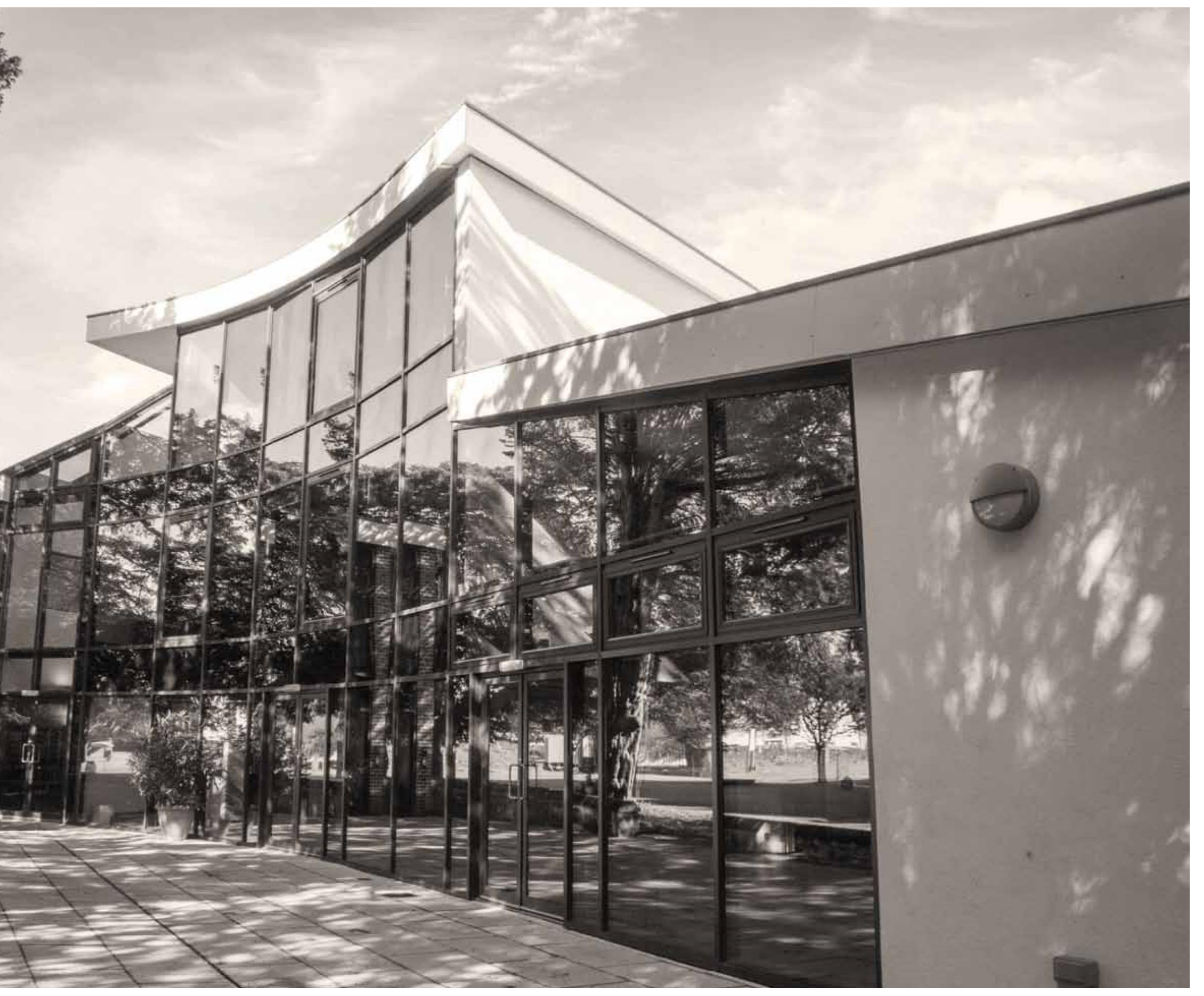
A stunning venue...