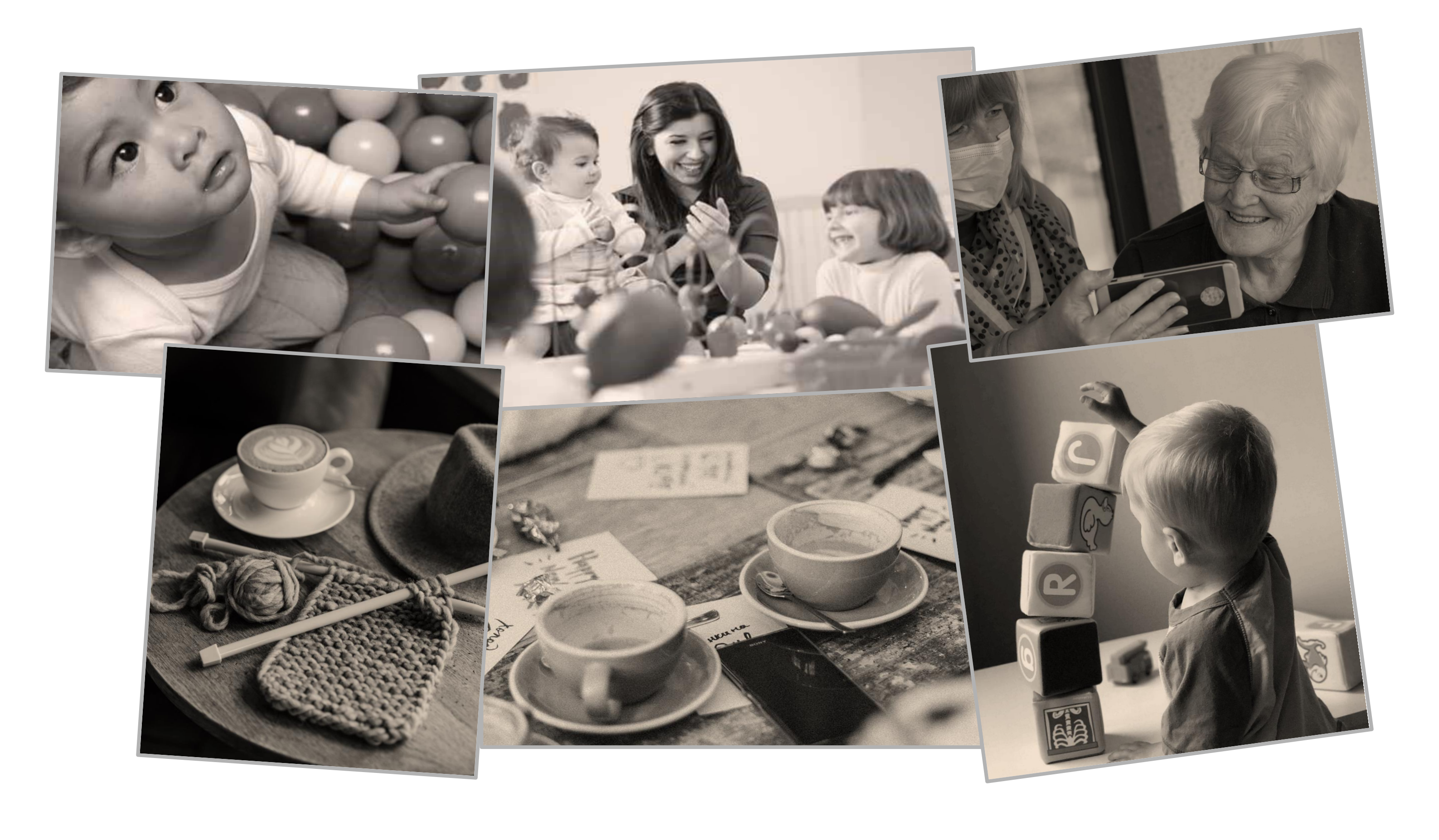
By booking our venue you support local charities & community projects